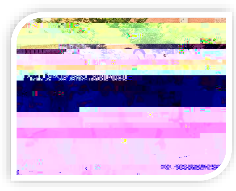
ASB Students Participating in service-learning reorientation project in downtown Wichita